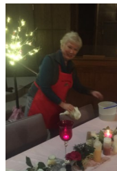
Missions' Valentine's Lasagna Dinner