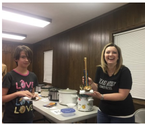
Family Game & Movie Night

Saturday, March 2nd from 3-5pm 3 year olds through 5th grade Please let the office know if your princess can attend