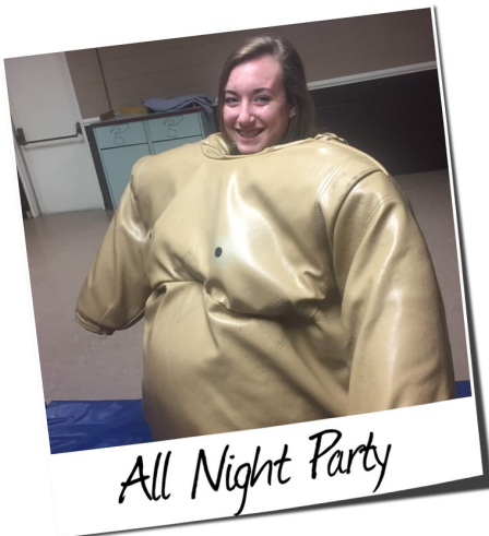
All Night Party