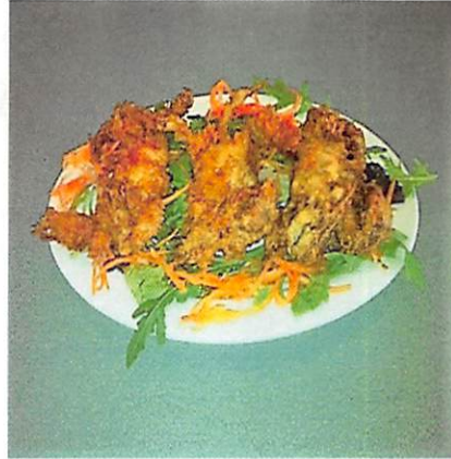
Deelicious Soft Shell Crab (# of crab depends upon size)