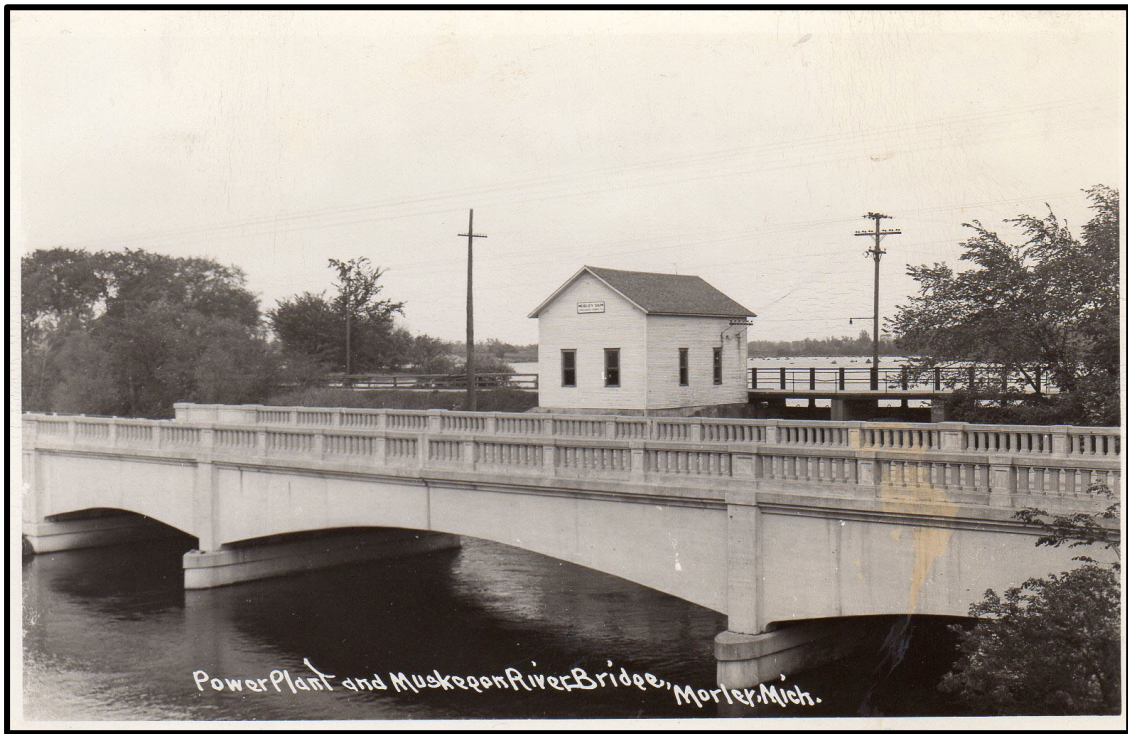
Power Plant and Muskegon River Bridge, Morley, Mich.