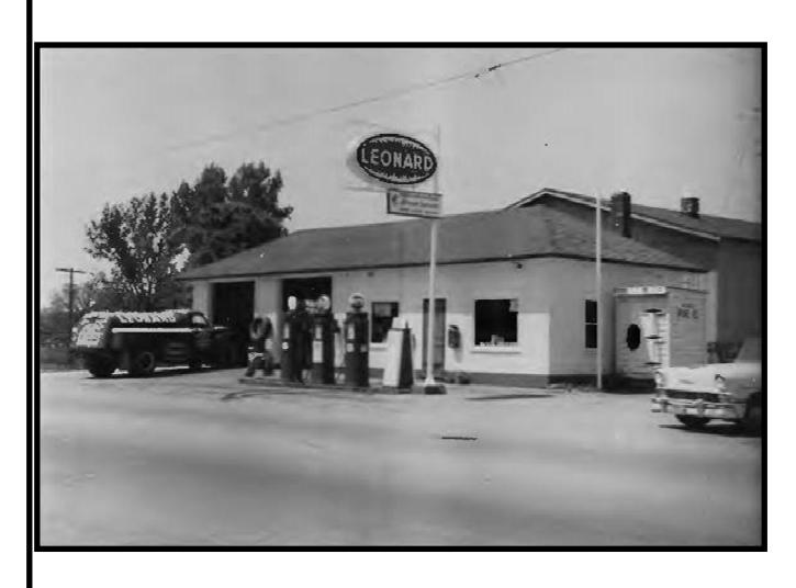
Remember this gas station? It was located on the southwest corner of Cass Street and Third Street.