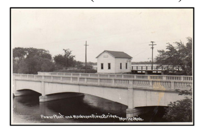
Prepared by the Village of Morle