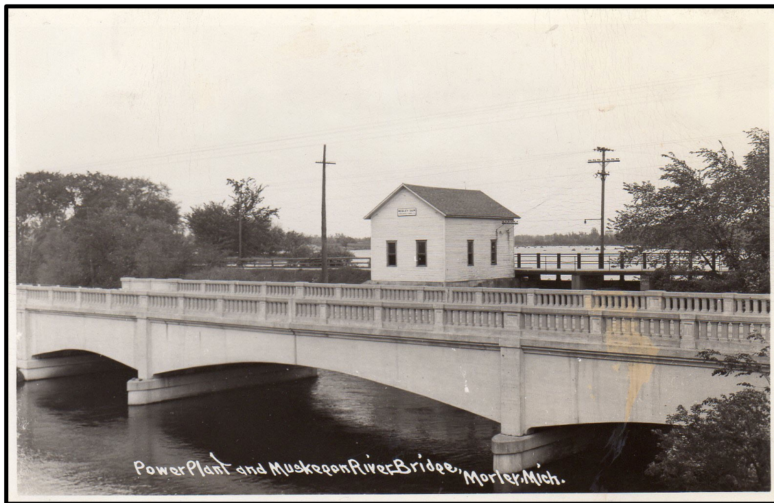
Power Plant and Muskegon River Bridge, Morley, Mich.