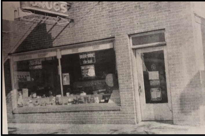
Pictured above: Brook's Pharmacy was a longtime landmark in the Village of Morley.