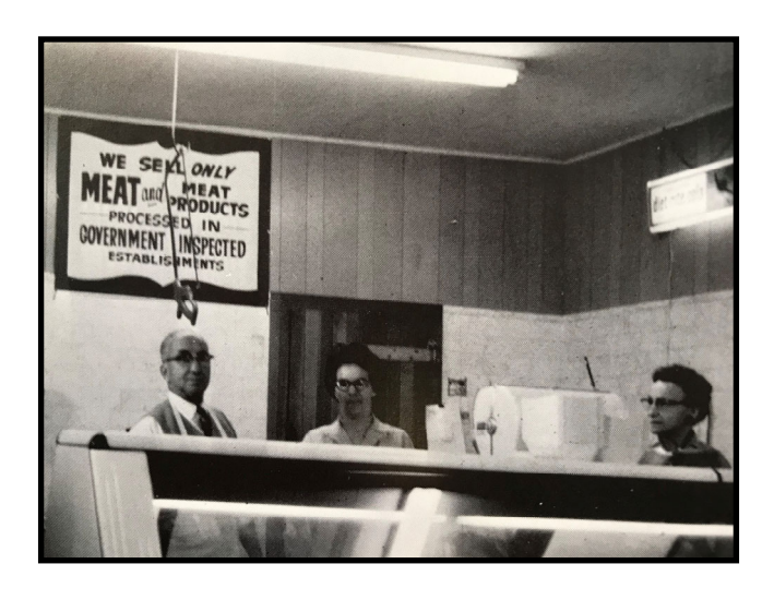
Do you remember the meat department at McNulty's (Corner Store on Cass and Fourth Streets).