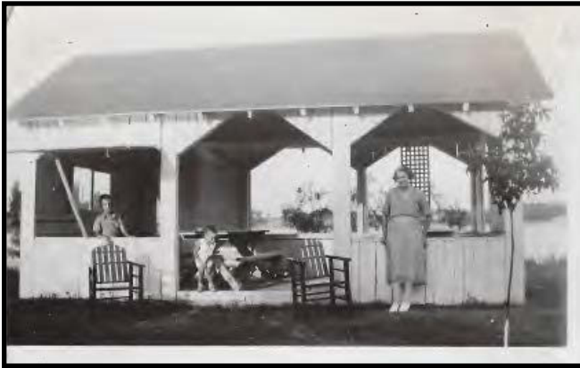
Remember the pavilion that was once at the east end of Second Street next to the pond?

Household Hazardous Waste Collection Chippewa Hills Intermediate School