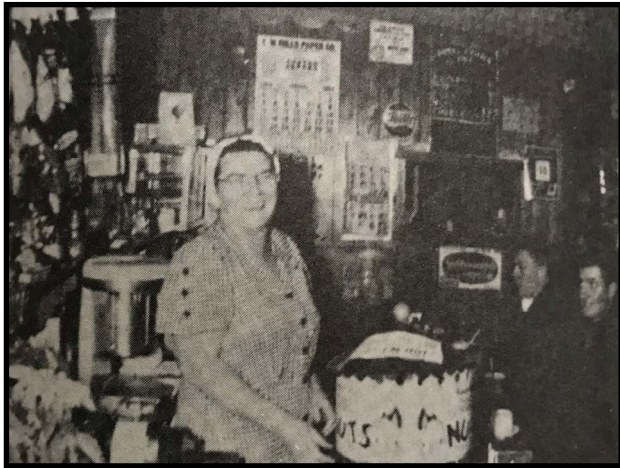
Do you remember Elsie's Restaurant? It was located north of town on the east side of Northland Drive.