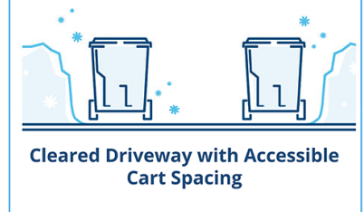
Cleared Driveway with Accessible Cart Spacing

When placing your recycling and waste out for collection, please be mindful of the plows and areas where heavy snow banks are present.