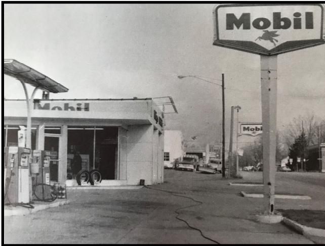
If you're old enough, you'll recognize the above gas station as the one on Third and Cass. Henry's garden is located on this spot.