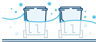
Carts Covered with Excessive Snow