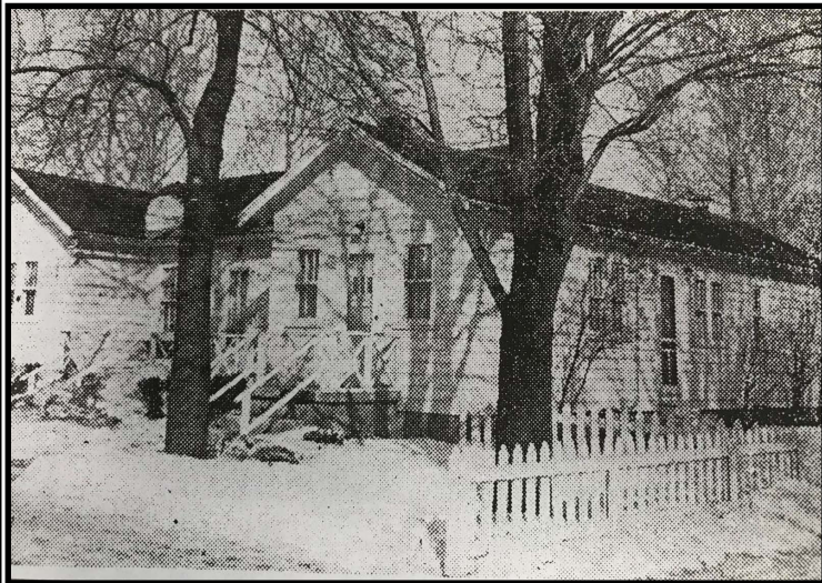
Pictured above: Remember when this building on Cass Street was a doctor's office and home in the 1950s?