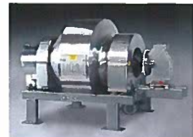
Rotary Batch Mixer

Size Reduction Hammer Mill, Rotary Cutter, De-Clumper, Pin Mill, Attrition Mill & Shredder