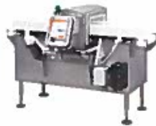
Metal Detectors and Checkweighers for Bulk or Packaged Products