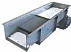
Vibratory Feeders, Scalpers and Screeners

World authority in advanced technology for magnetic, vibratory and inspection system applications.