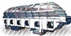
Fluid Bed Dryers