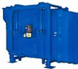
Atlas Gyrotary Sifter and Multi-Motion Rectangular Separators