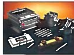
Grate, Tube, Plate & Trap Magnets; Permanent and Electro Belt Magnets