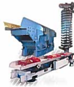
Vibratory Feeders & Conveyors