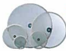
Supertaut Plus Screens fit nearly all Circular Separators