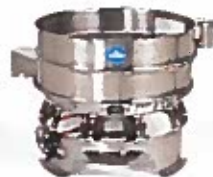
HX, Classic and Pharma Round Separators and Dryers

The World Leader in Particle Separation and Size Reduction Solutions