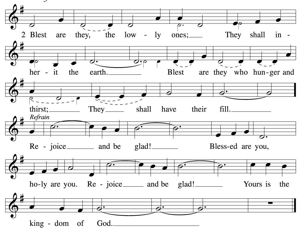
Blessed Are The Merciful

P: "Blessed are the merciful, for they shall receive mercy." (Matthew 5:7)