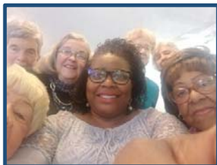
With Disciples Women in MS