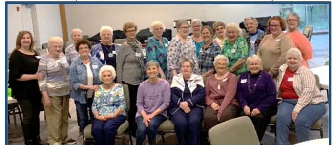
Disciples Women in Arkansas workshop

For those Disciples Women who were unable to attend their local workshop – all handouts will be on the Disciples Women page of the regional website – www.grrdisciples.org .