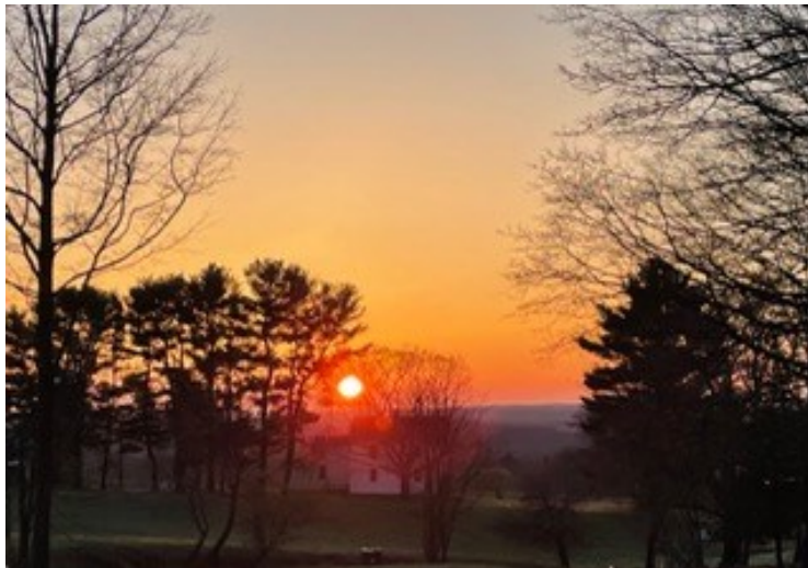
Bolton Congregational Church Sunrise Service overlooking Heritage Farm .