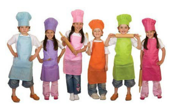
Entries will be accepted November 1 – January 15, 2018!

Hearty Breakfast Nutritious Lunch Wholesome Dinner Snacks/Appetizers Healthy Desserts Allergy Free Recipes Best Cooking Video!