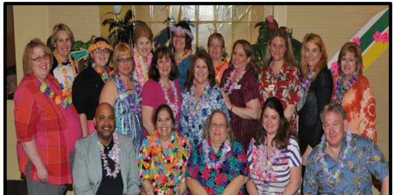
West Virginia PTA Board of Managers 2015-2017

"I'd like to thank our West Virginia PTA Board of Managers for working with me the last two years. These men and women are volunteers and give countless hours to our state PTA. Each one has a specific job, and all positions are equally important to our success. We are a team and I have valued their input, their ideas, and their hard work.