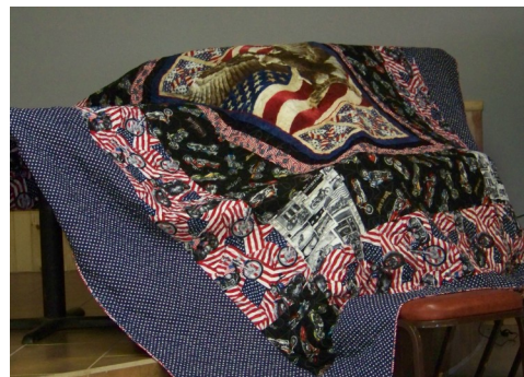
$5 Raffle at Fridley ALR Arrival Party