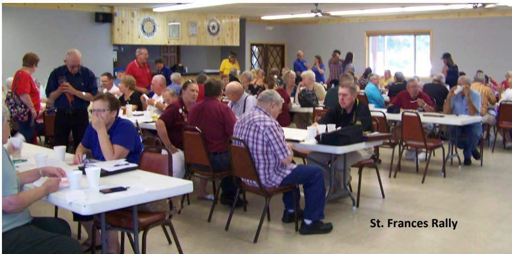
St. Frances Rally