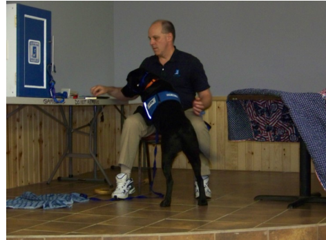
Cmdr's Project—Helping Paws